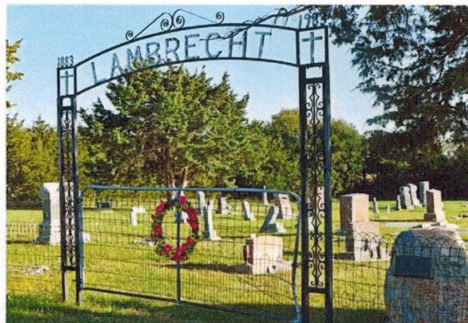
The Lambrecht Cemetery is located 10 miles west of Pierce on 854 Road, the Pierce/Neligh road. Many of the grave markers are either broken or leaning. The Lambrecht Cemetery Association has undertaken a restoration project and is currently raising funds to complete the project. Seventy-five markers need attention at an estimated cost of $11,000.

Be it family or friends, nearly everyone in the Pierce area has a loved one interred at The Lambrecht Cemetery (also known as The Tawney Cemetery) located 10 miles west of Pierce on the Pierce/Neligh road.